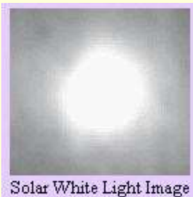
Solar White Light Image

If I or my family, relations, Ancestors or our past incarnations, Have offended in thoughts, Words or deeds, From the beginning of time To the present, Please forgive, cleanse & purify us. I forgive myself From the God/dess of my Being; Release, sever & cut All unwanted energies & vibrations We have created or accumulated And accepted from the beginning of time. Transmute all to pure Light.